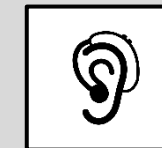
assistive listening devices