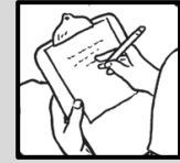
pen and paper