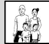
get my family