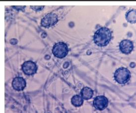
Histoplasma capsulatum cdc.gov

Histoplasma capsulatum is found in many countries globally but is most common in North and Central America. It occurs in the environment, particularly in soil containing droppings from birds or bats. The fungus can cause mycosis in humans as well as affecting other animals such as dogs and cats.