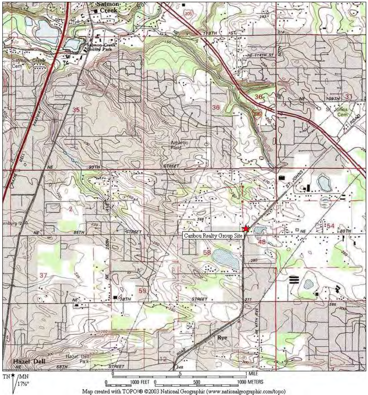
Figure 1: Vicinity Map Caribou Realty Group Site Vancouver, Washington