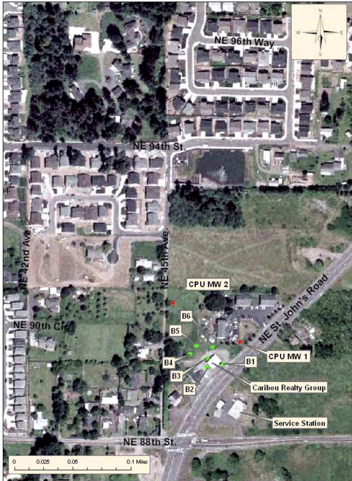
Figure 2: Site Map Caribou Realty Group Site Vancouver, Washington