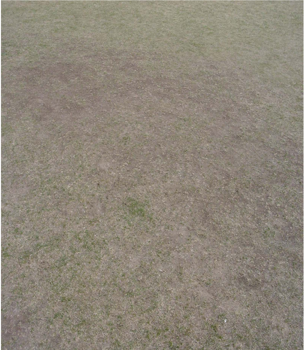
Figure 4. Gilbert Elementary School playfields, Yakima Washington.