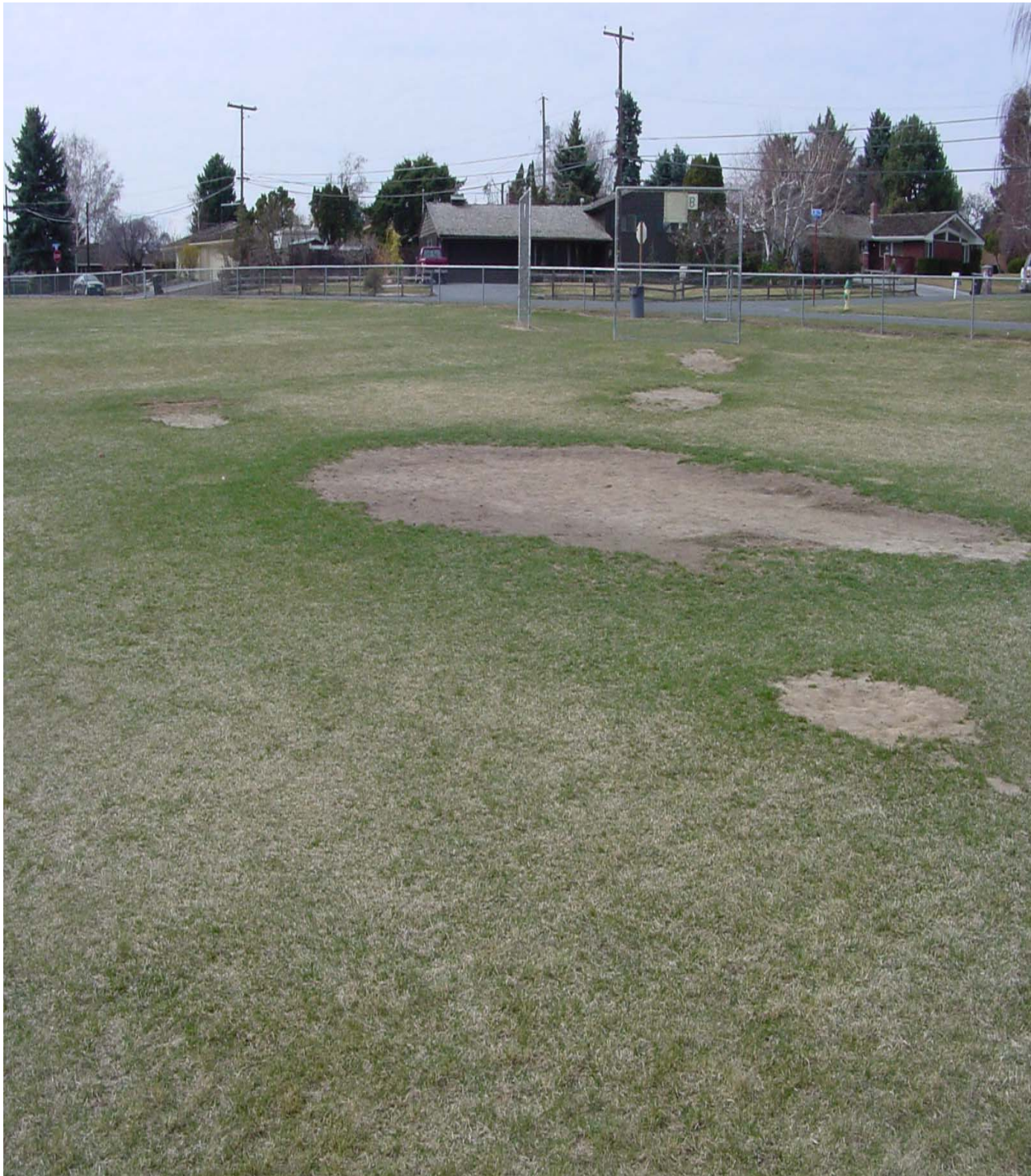
Figure 2. Exposed soil along baseball field, Gilbert Elementary School, Yakima, Washington.