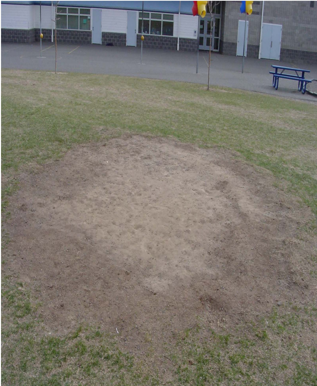
Figure 3. Playground field at Gilbert Elementary School, Yakima, Washington.