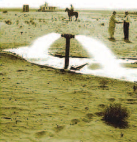
Moses Lake, 1911