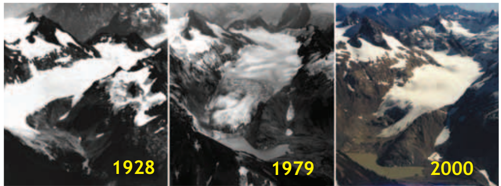
South Cascades Glacier in Glacier Park Wilderness has retreated more than three-quarters of a mile since its last major advance in the 1500s.

Much of Washington's water supply is stored in snow pack and glaciers that slowly melt, feeding streams and rivers. Less snow to