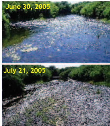
Dry river bed of Tucket River in Walla Walla County in 2005 drought.

What can we do now to prevent and prepare for drought? There is little disagreement in the scientific community that rising temperatures are related to climate change, which is a direct result of carbon dioxide and other greenhouse gas emissions from human activities. In 2007, Washington's Climate Advisory Team reported that implementing measures to reduce greenhouse gas emissions statewide could yield a collective net benefit to the state of more than $900 million by 2020.