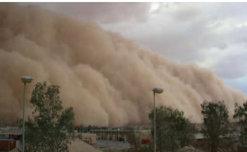
A dust storm envelops an Idaho community. Weather systems are fed by energy (heat) in the atmosphere. Extreme weather events are expected to become more common with climate change.

✳️ More frequent droughts in Yakima may cause more crop losses due to water shortages. While drought does not occur every year, the average losses may increase to $66 million for Yakima. (The Yakima River Basin produces crops worth about $1 billion annually.) Other agricultural areas statewide are likely to face similar effects.