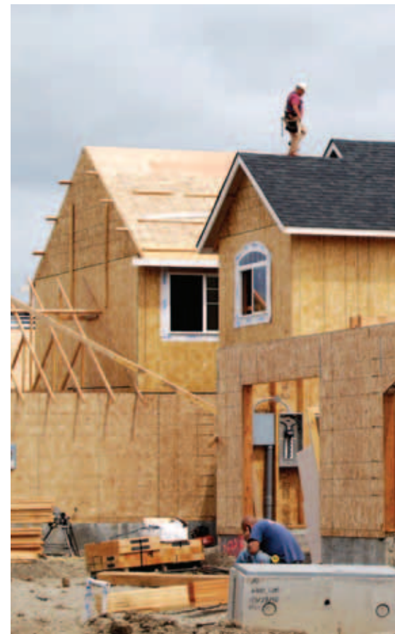
Housing construction has mushroomed in recent years.