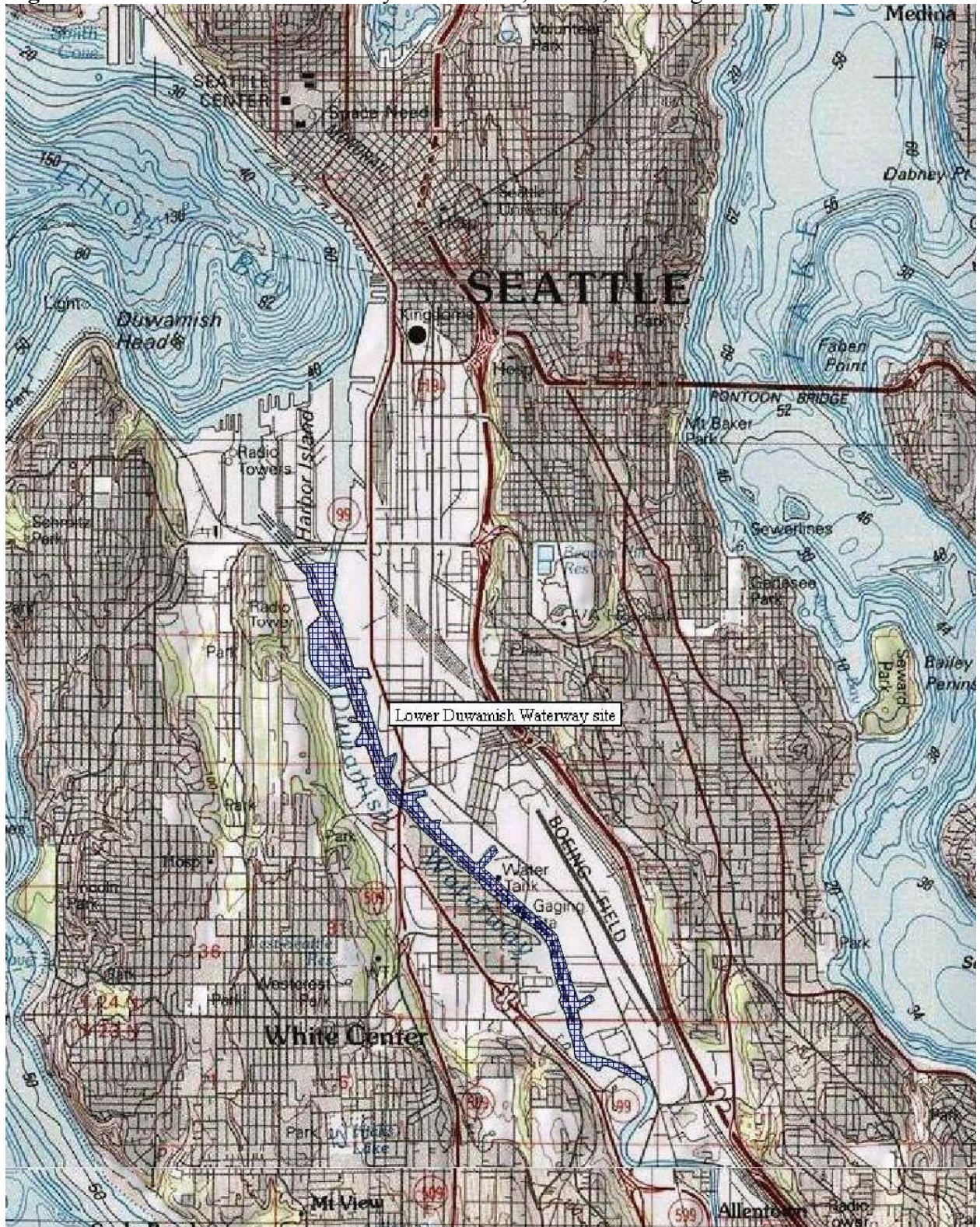
Figure 1. Lower Duwamish Waterway site location, Seattle, Washington