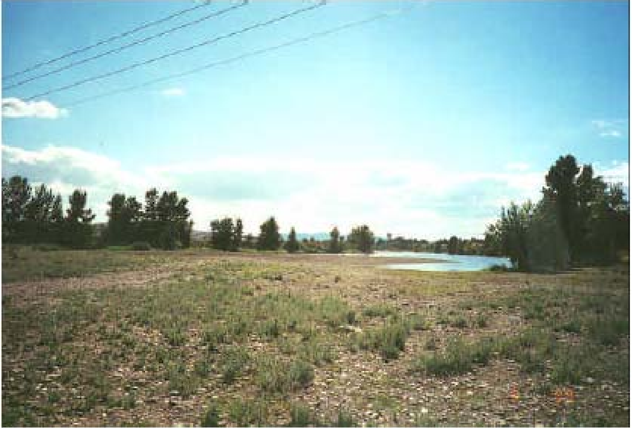
Figure 3. Common Use Area River Road 95 at Star Road Spokane River, Spokane, Washington.